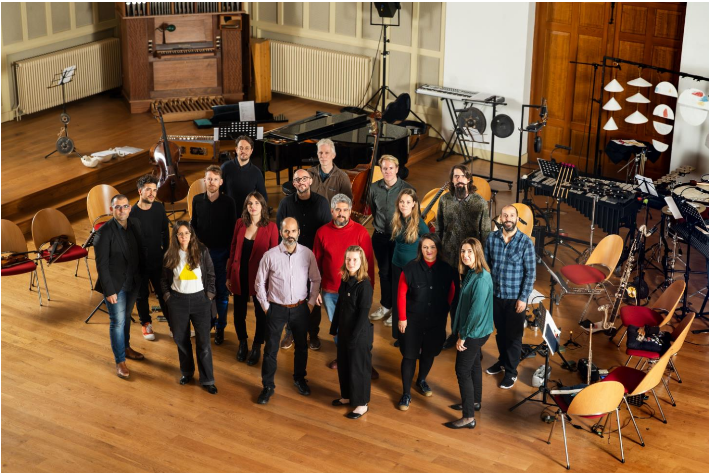
Modelo62 at the 20 Years Celebration Festival.