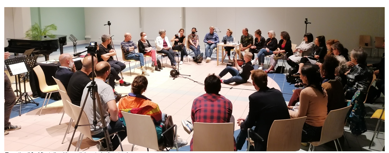
Together#6: Aftertalk with participants in Amsterdam

We managed to successfully engage participants that wanted to take part on their own initiative, but also by connecting with organisations of amateur musicians who wanted to participate collectively. As a result, we present the piece four times in Amsterdam, Rotterdam (in collaboration with Vakir), Eindhoven (in Collaboration with CoMa Eindhoven) and Maastricht (in collaboration with CoMa Maastricht).