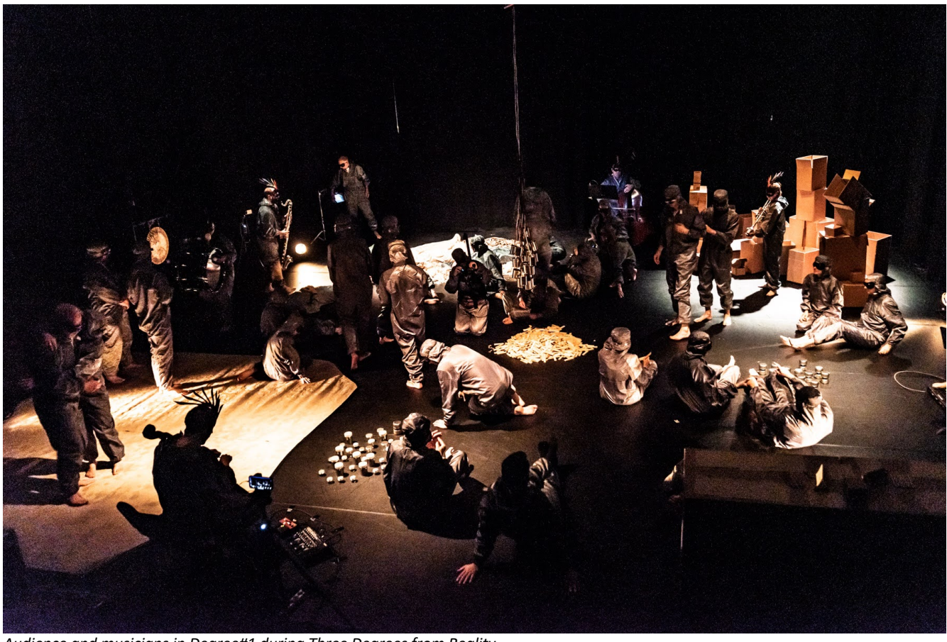
Audience and musicians in Degree#1 during Three Degrees from Reality