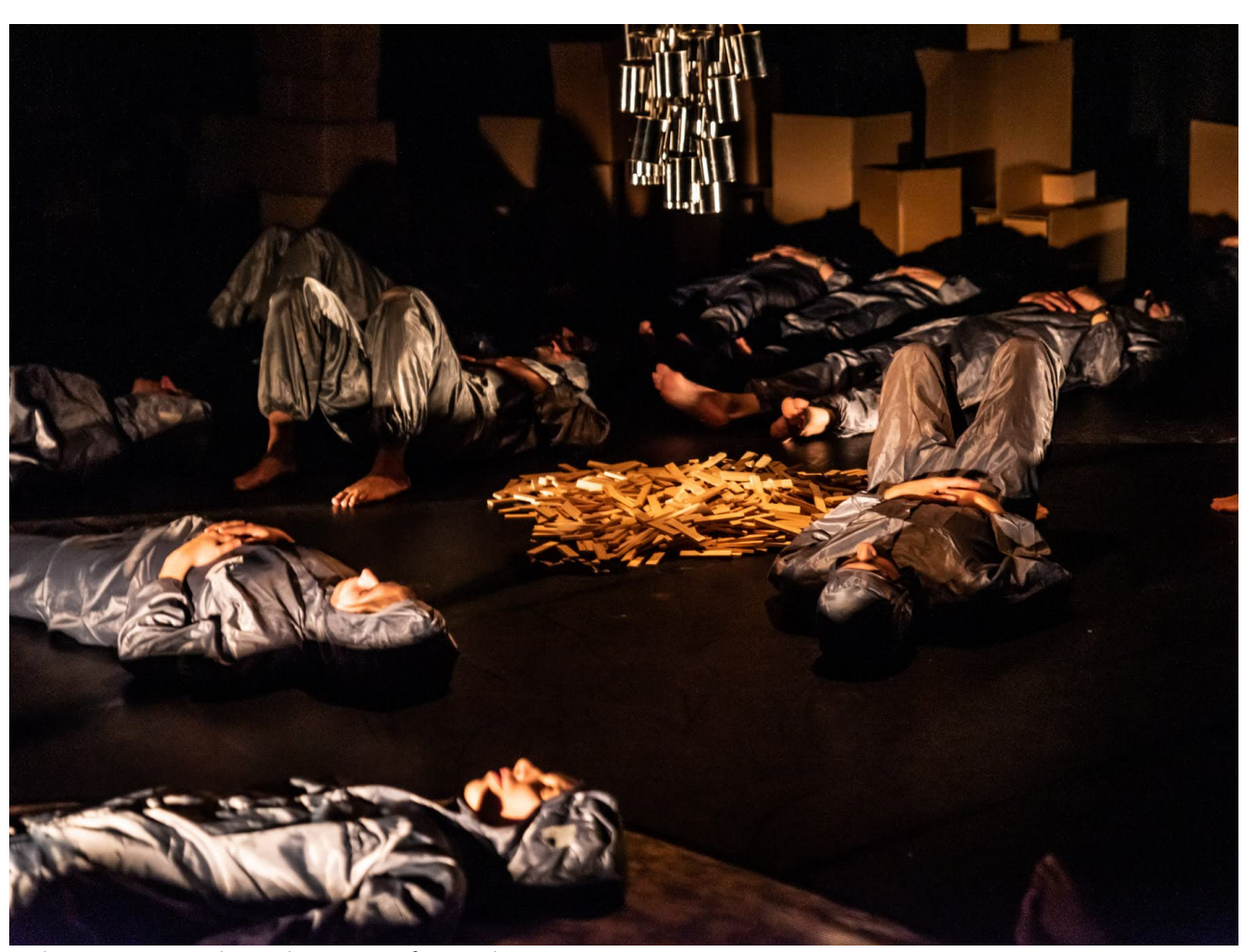
Audience in Degree#1 during Three Degrees from Reality