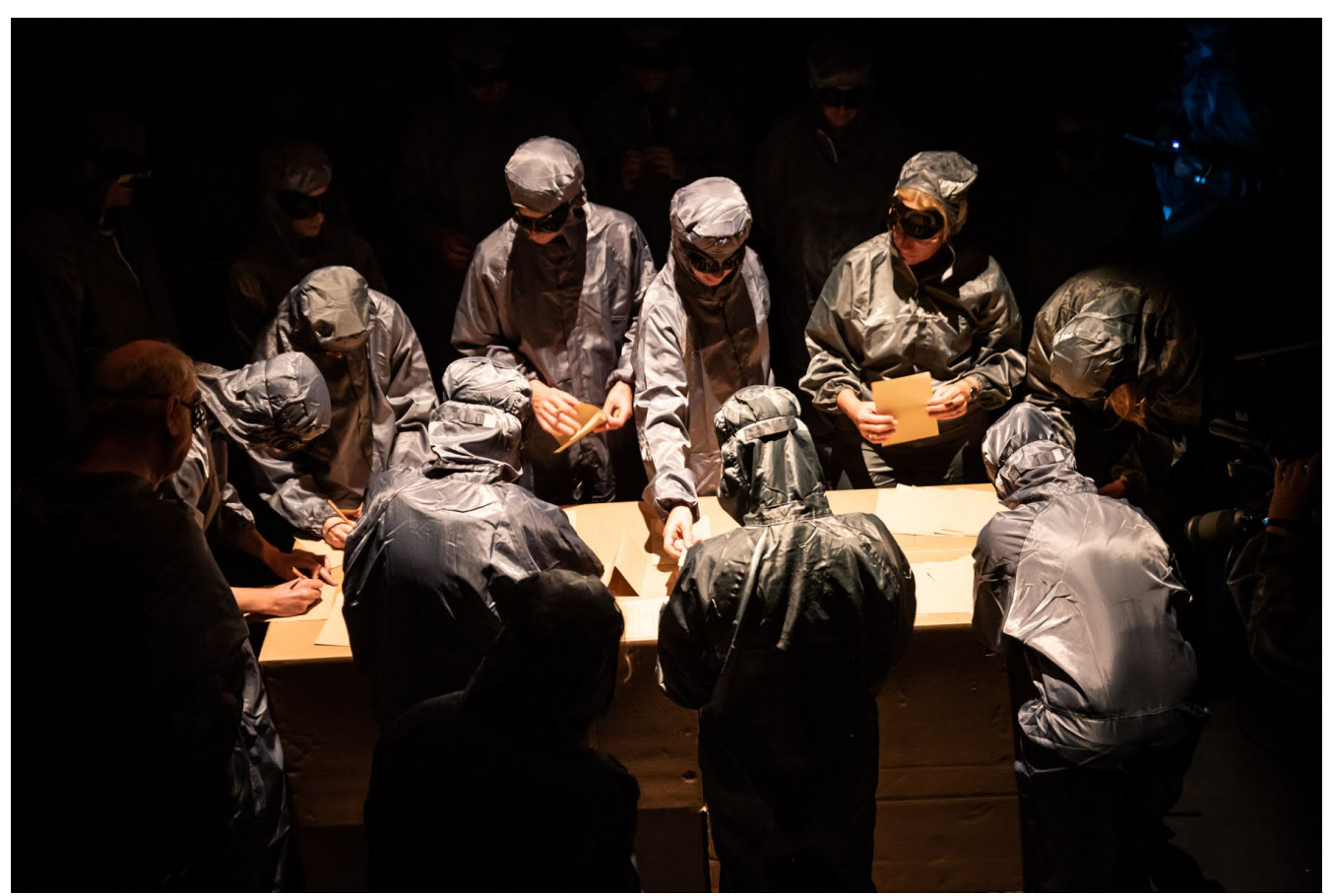
Audience writing their thoughts, fears and things they love during Three Degrees from Reality